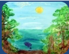
Calahan's Beach

Ryan White funds a pilot ADHC facility in Queens.