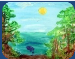
Calahan's Beach